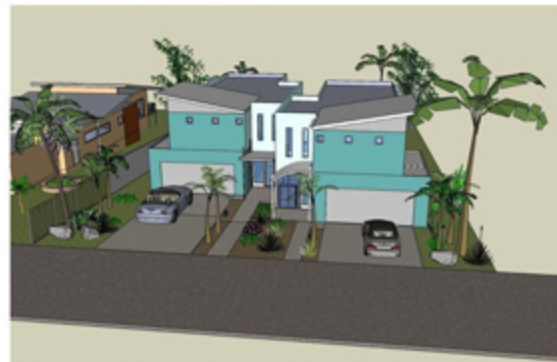
AERIAL STREET VIEW