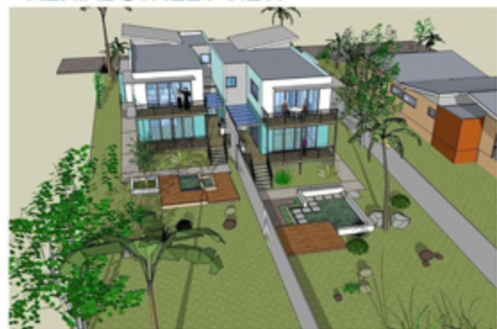
AERIAL REAR VIEW